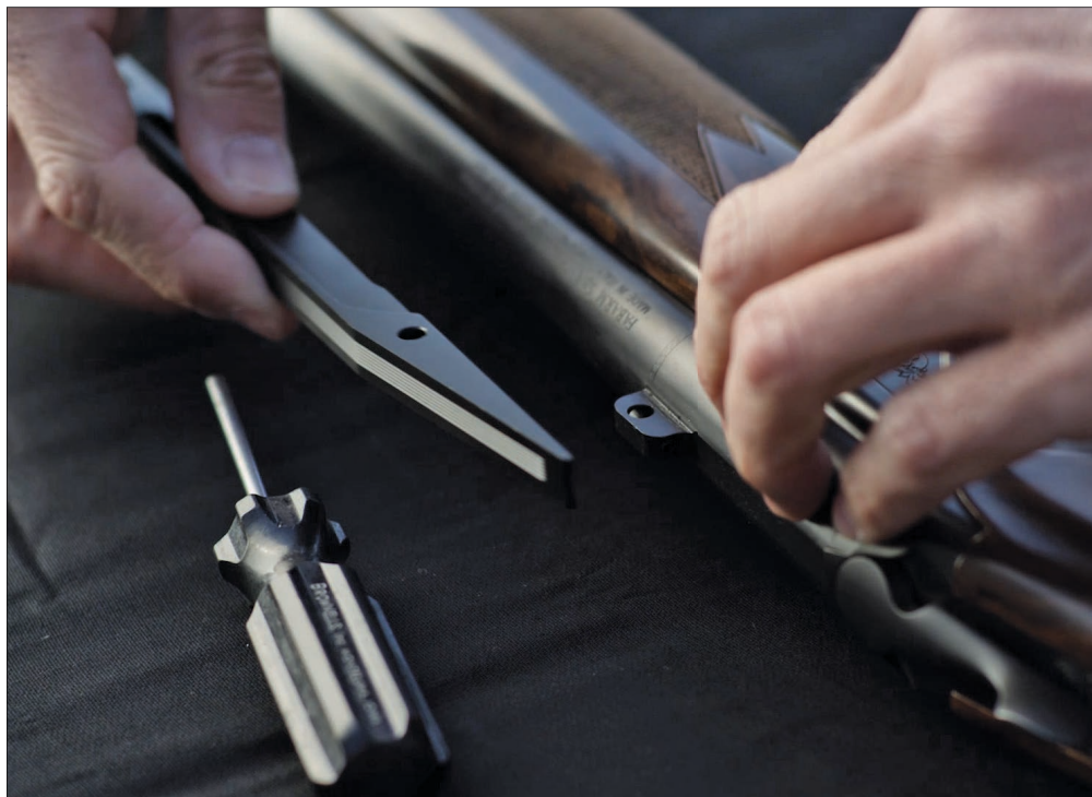
▲ Fabarm's Quick-Release Rib makes swapping out the interchangeable ribs simple. Two are included.