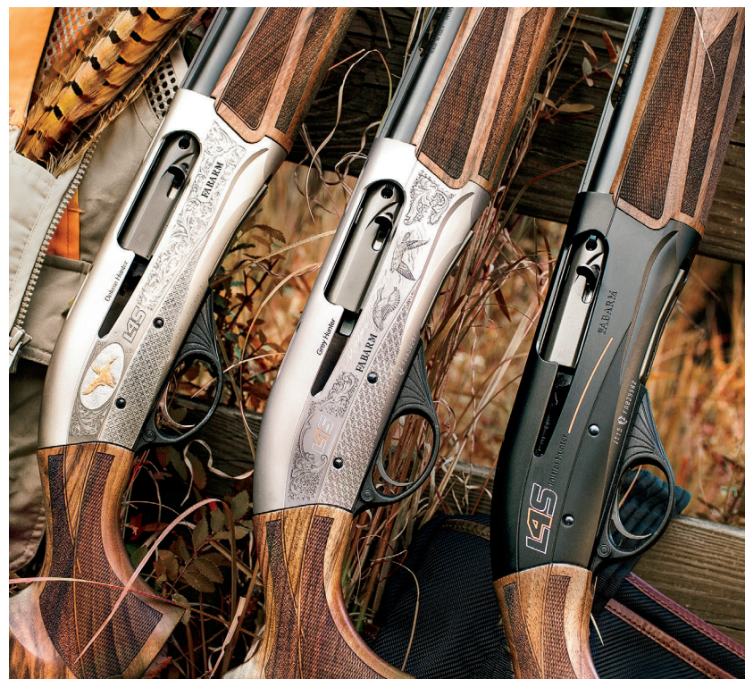
From left to right: The L4S Deluxe, Grey and Initial Hunter.

All in all, the L4S Deluxe Hunter gets plaudits for both styling as well as shootability. Its light weight makes it a delight to carry, and it hit where I was looking. Although the cost is rather high for a semi-auto, it is about the minimum for a decent over/under, and for this price, there's no way you can find an O/U with this quality of wood and finish. So from that perspective, the L4S represents a good value for a reliable, high-quality field gun.*