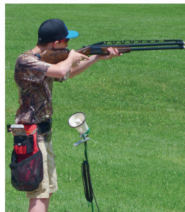
YOUNG SHOOTER PUTS OUR TEST GUN THROUGH ITS PACES.

SUGGESTED RETAIL: TRAP 0/U $4195, TRAP UNSINGLE $4195, TRAP COMBO $5775