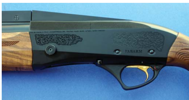
The Fabarm XLR5 Velocity features a step on top of the receiver to make the transition to the high rib.

Even while still in its impact plastic case the XLR5 was impressive. There were several other customers at Schultz's Sportsman Stop (the FFL dealer my test guns come through), and there was a lot of oohing and aahing going on when the case