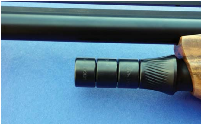
Three 1½-oz. weights that screw right into the fore-end cap are provided with this Fabarm semi-auto, allowing fine tuning of the gun's balance.

out of the Fabarm factory. Not only does the walnut have wonderful grain, the finish is particularly pleasing to my eye, ending up with just a bit of a “blonde” color touch. Further, close examination shows that the wood’s pores are very well filled in, and I don’t find this characteristic on all the shotguns I test.