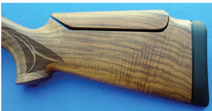
The back of the XLR5 Velocity's walnut buttstock has a step down that allows a "higher" adjustable comb to the stock.

My test gun is a definite prototype, and as this is being written there are only two in the country, though I'm told that many XLR5 orders were written in Las Vegas. Very impressive is the walnut on this test gun. As you are now looking at some of the photos accompanying this article, it's easy to note that this wood is very special. Hopefully there will be similarly impressive wood on the guns that eventually come