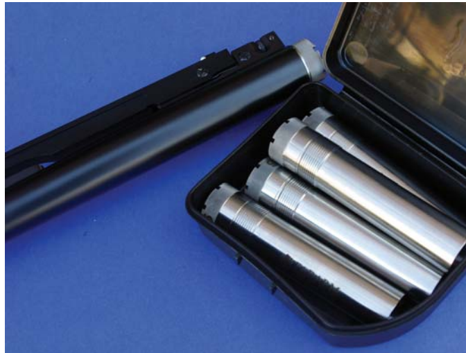
Fabarm’s XLR5 Velocity includes five screw-in chokes at just over 3½” long.

Adjustment of the adjustable stock is conventional: loosen hex-head screws to remove the top comb. Once the top of the comb is off, there are two threaded posts that you can turn